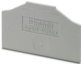
Partition plate, length: 55.7 mm, width: 1.5 mm, height: 34.3 mm, color: gray

Please be informed that the data shown in this PDF Document is generated from our Online Catalog. Please find the complete data in the user's documentation. Our General Terms of Use for Downloads are valid ( http://phoenixcontact.com/download )